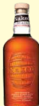
Naked Malt Whisky

SAVE $43.00 $125.00 per bottle (Usual Price: $168.00)