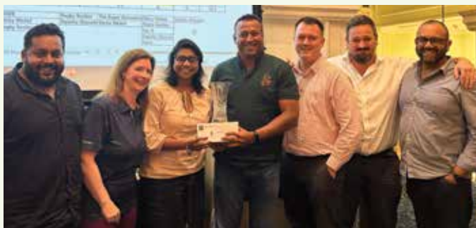
Winner – Sticky Wicket (Cricket Section)

Overall, it was a successful event organized by the Members Engagement Subcommittee. We encourage you to participate in the monthly Quiz Night; for more information, please email memberengagement@scc.org.sg .