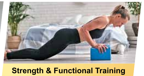
Strength & Functional Training