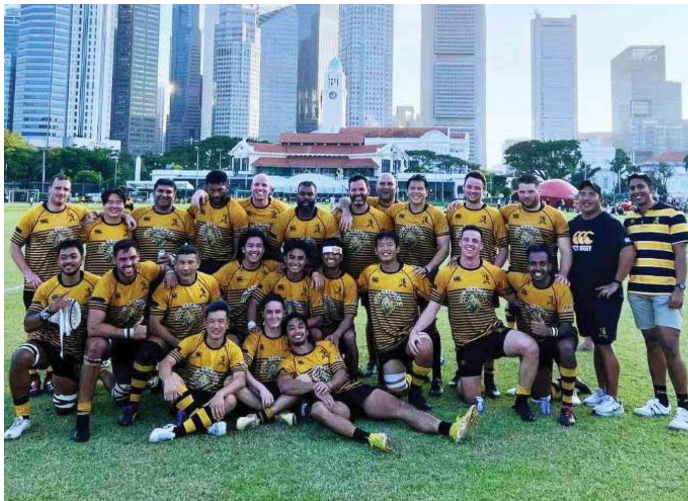
SCC Tankards' victory shot post-match against Bucks.