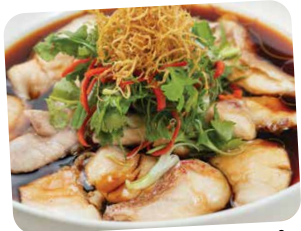
Steamed Red Snapper Fillet in Superior Soy Sauce Served with Fried Ginger Floss, Spring Onions and Red Chilli $17.00