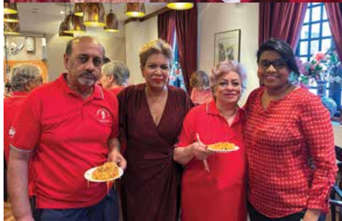
Mahjong Section's annual dinner on 24 February.