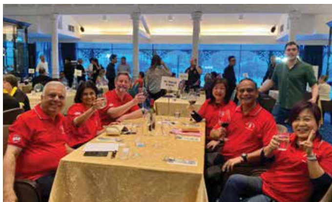
Mahjong Section team competing in the Intersection Quiz Night.