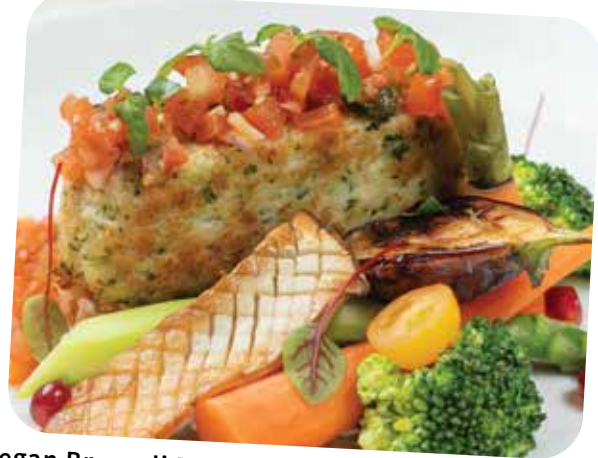
Vegan Broccoli Beancurd with Garden Vegetables Broccoli Bean Curd, Sautéed Quinoa with Picante Sauce $14.50