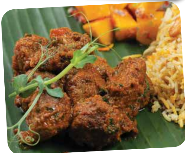
Vegetarian Mock Mutton Biryani Served with Mango Salad & Vegetable Curry $13.00