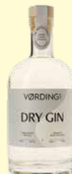
Vording's Dry Gin

SAVE $37.00 $88.00 per bottle (Usual Price: $125.00)