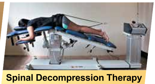
Spinal Decompression Therapy