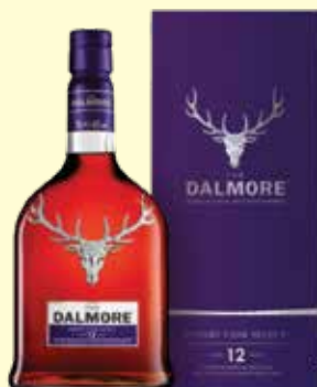
Dalmore 12 Years

SAVE $206.00 Three Bottles: $298.00 (Usual Price: $504.00)