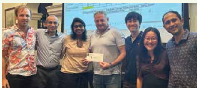
2 nd runner – Squishy (Squash Section)