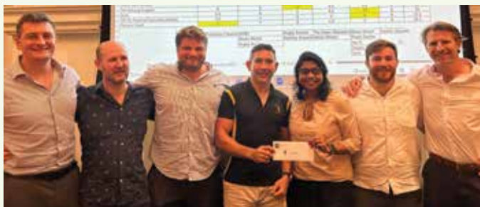
1 st runner – Rugby Section