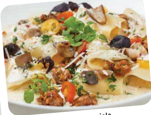
Paccheri Boscaiola Pasta Paccheri with Ground Pork and Porcini Mushroom in Truffle Cream Sauce $16.50