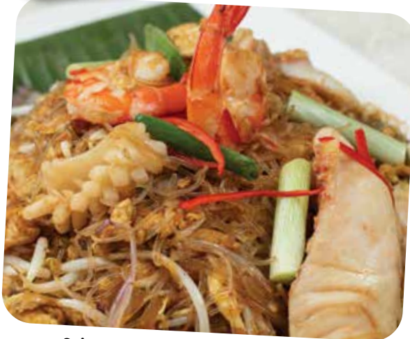
Stir-fried Seafood Glass Noodle With Prawns, Fish Fillet, Flower Squid and Chives $12.50