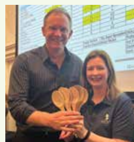
Wooden Spoons Winner