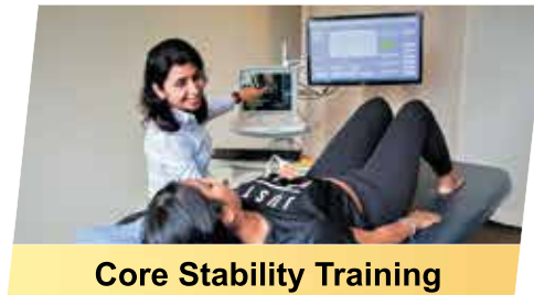
Core Stability Training