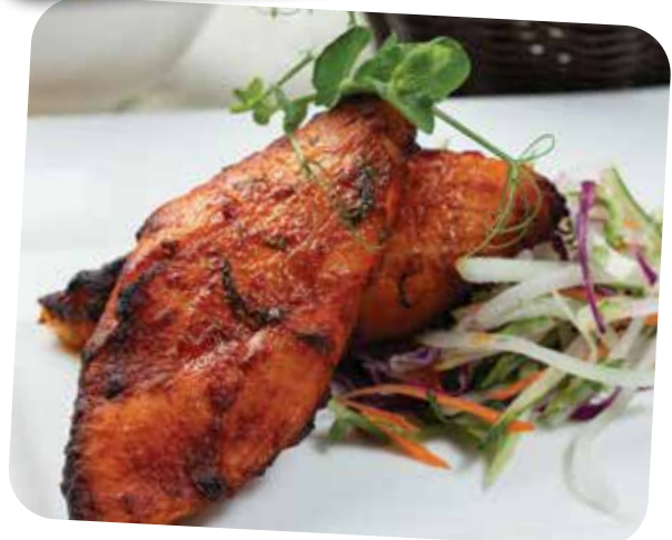
Tenggiri Fish Tikka Served with Garlic Naan & Cucumber Salad $14.00