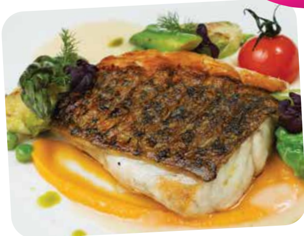
Pan-fried Red Snapper Fillet Served with Mashed Mousseline, Mango Salsa & Roasted Garden Root Vegetables $25.00