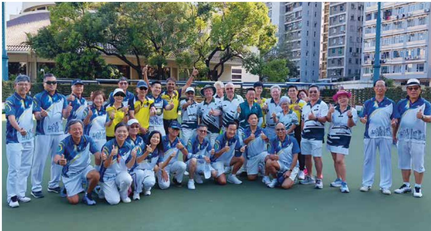
Joint TC & SCC Team at the HK Police Recreation Club, Kowloon