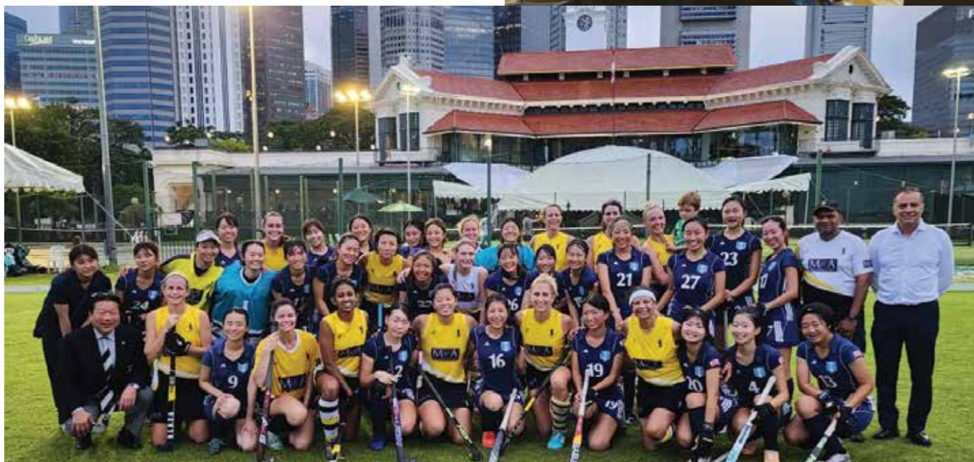
From top: Keio Uni show their appreciation; Ladies beat Keio 4-1