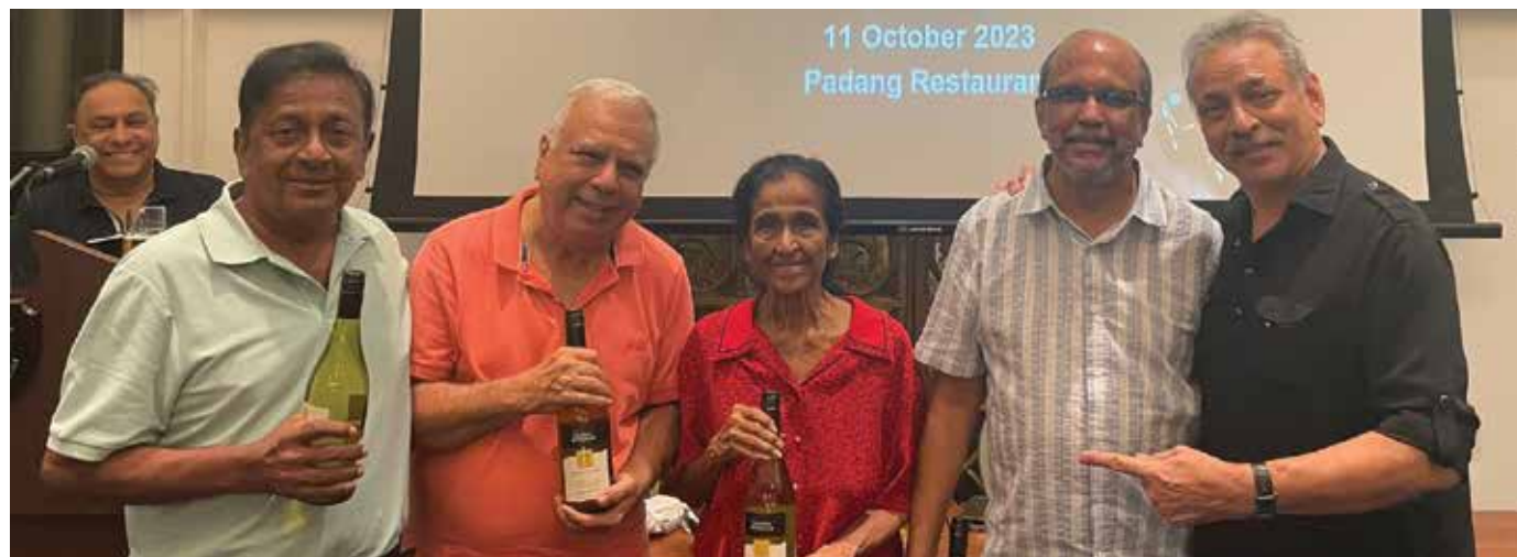
Interclub Round 6 winners SCC Team 3.

Gana from the winning team was highest scorer with 711 points over eight rounds with our Rajula in second spot with 674 points