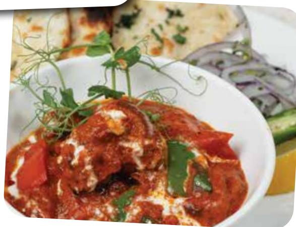
Chicken Tikka Masala Served with choice of Garlic Naan, Butter Naan or Plain Naan $14.50