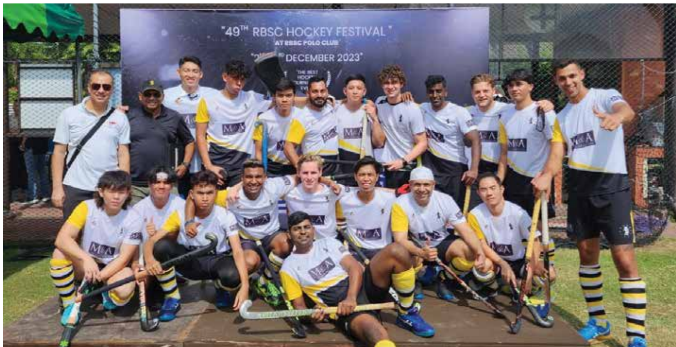
Royal Bangkok Sports Club Hockey Festival 2023

strong team but were goal shy on Day 1. We entered Day2 trying to qualify for the 2nd tier Chairman's Div II Cup and did that with a blistering 3-0 win over Valley from Hong Kong; we were however later undone by penalty strokes in the quarterfinals. Despite our deep disappointment, the newest Members of the Section have gelled together and 2024 is promising to be a good year with the camaraderie built.