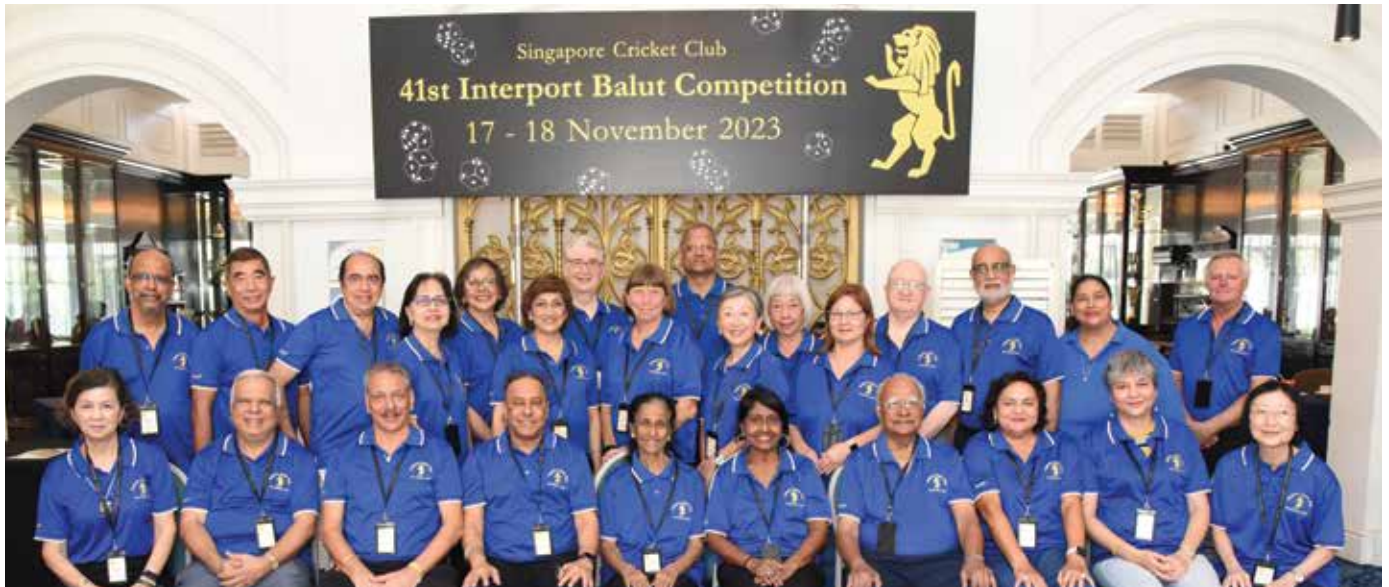
The SCC Balut Section at the Interport.