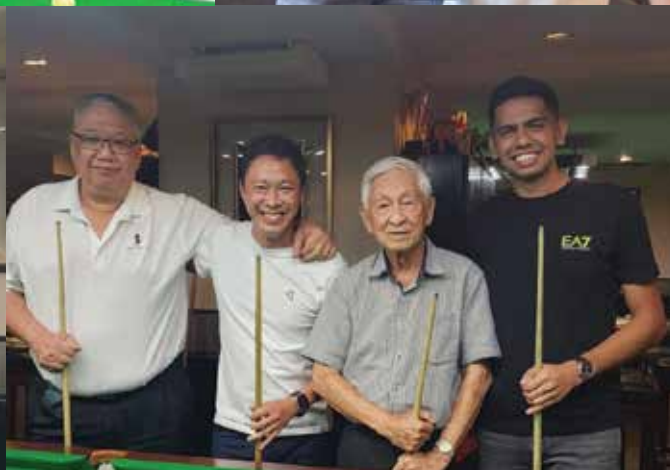
Second row: Billiards & Snooker Section Participants and Spectators.