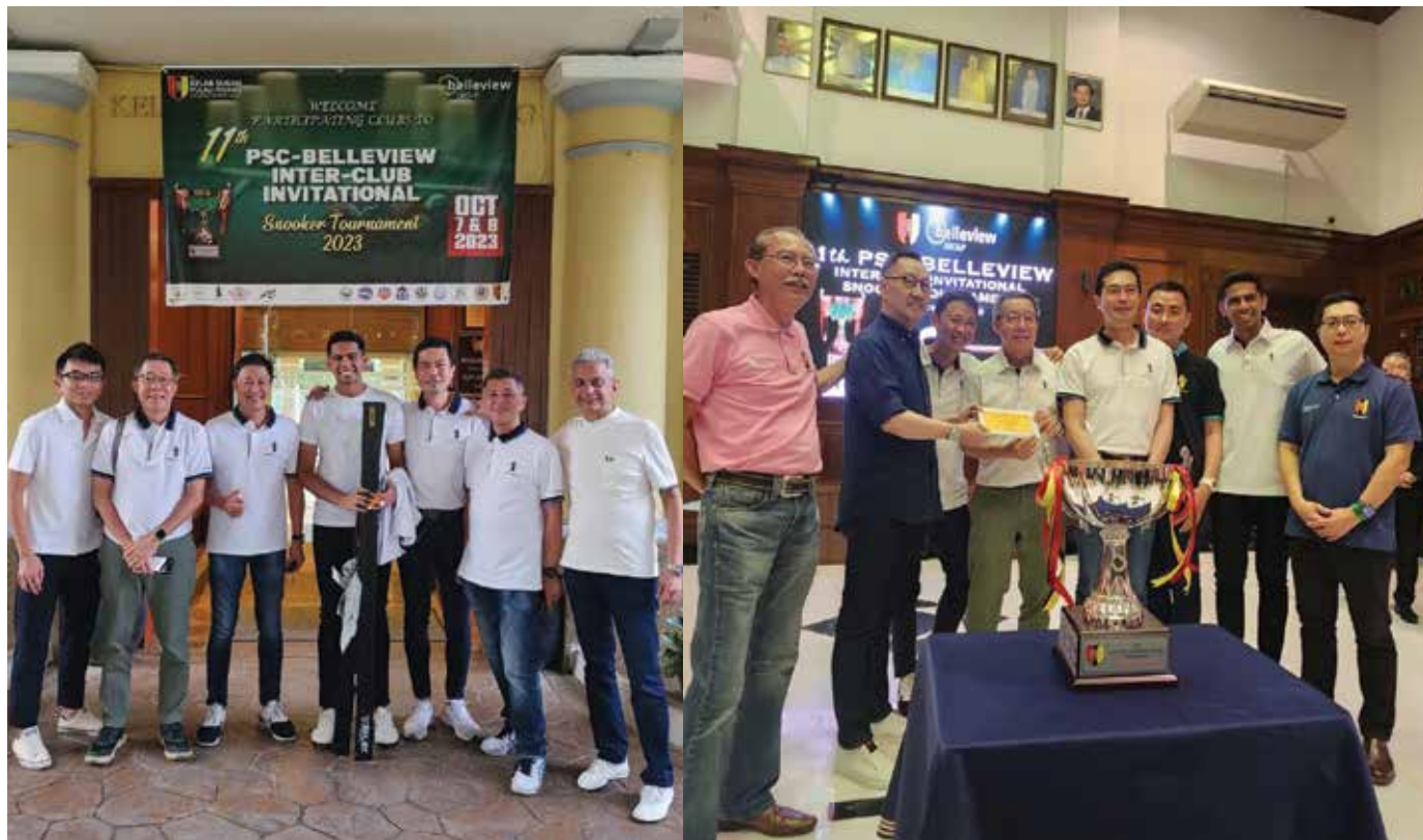
From left: SCC Team and supporters at the Penang Sports Club Snooker Tournament; Joint 3rd placed teams at the PSC tournament.

We lost in the semi-finals to Tawau Recreation Club from West Malaysia and ended up joint third in this very competitive event. Host Penang Sports Club (PSC) was the eventual winner.