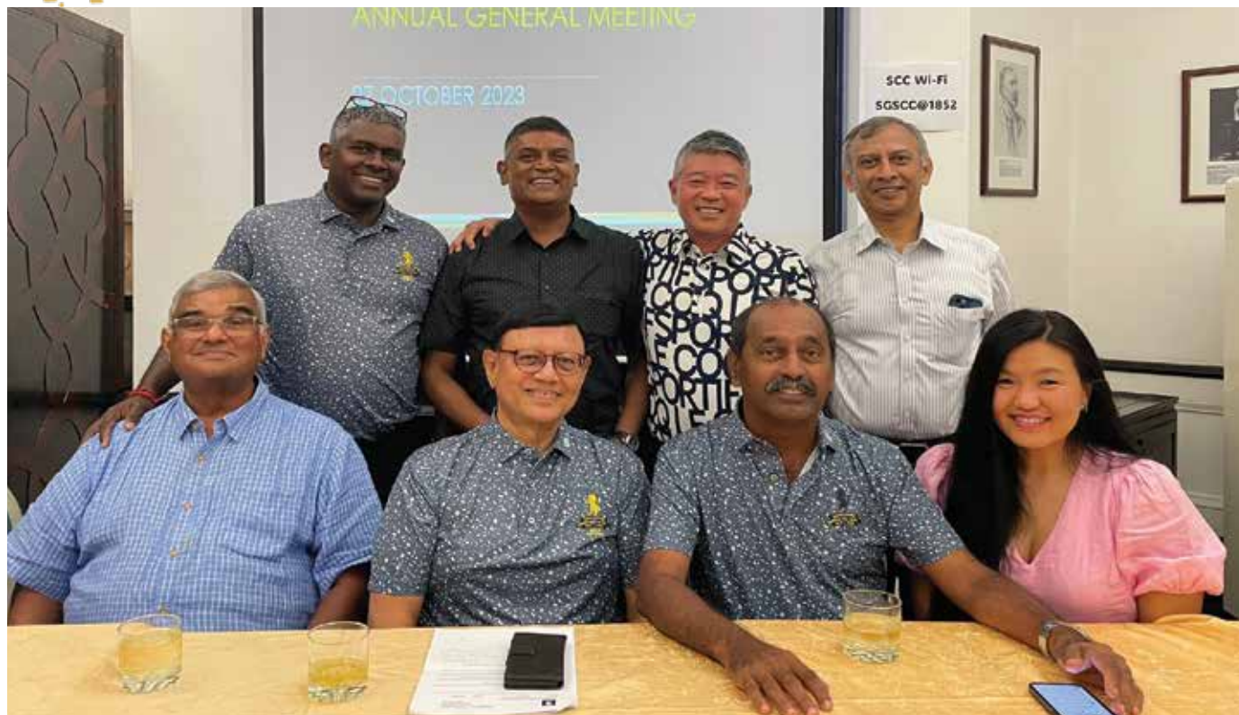
The new Golf Section Committee.