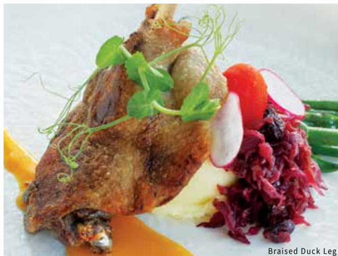
Braised Duck Leg

On public holidays, the Daily Set Lunch option at The Oval & Verandah will only be SCC Laksa.