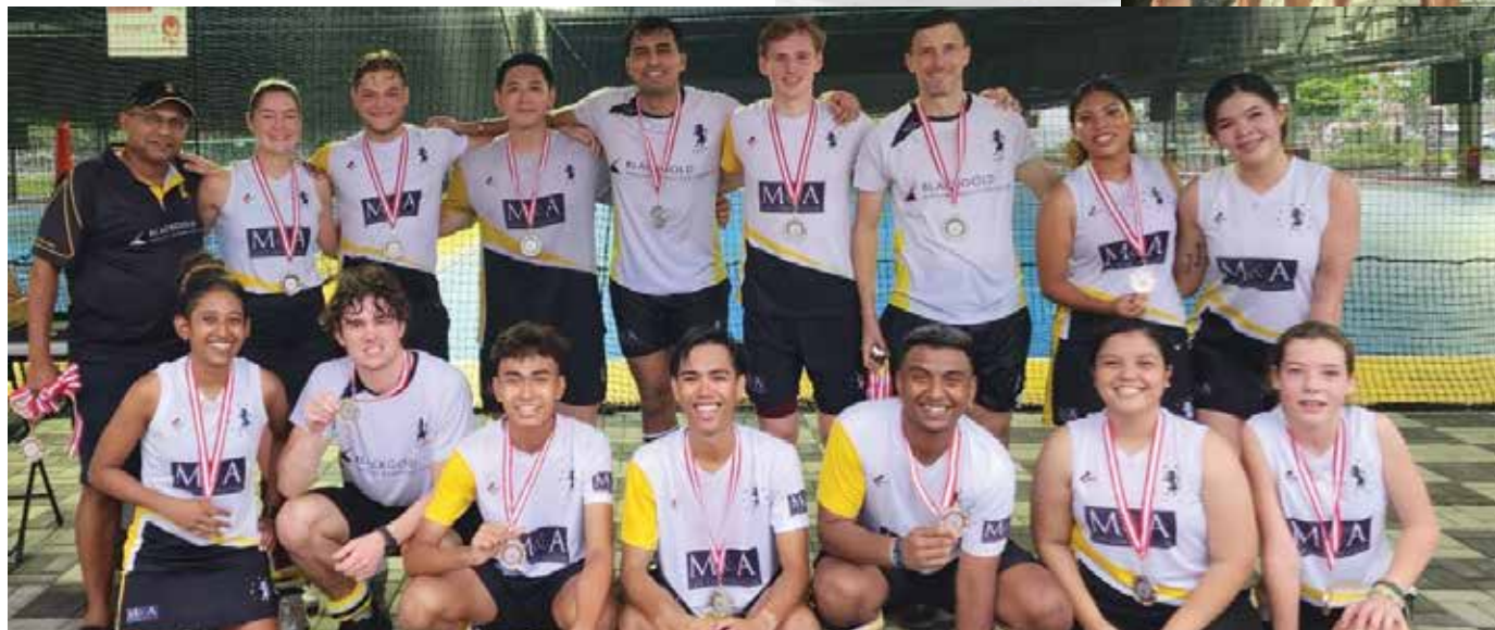
From top left, clockwise: HKFC Interport trophies; Teammates reconnecting in HK; Indoor silver linings.