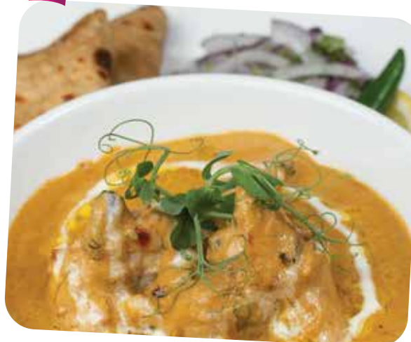
Murgh Malai Tikka Masala Served with Chapati & Onion Salad $14.50