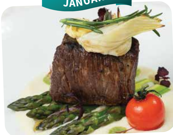
Herb Butter Seared Beef Tenderloin Served with Mashed Potato, Garden Root Vegetables & Black Pepper Sauce $28.00