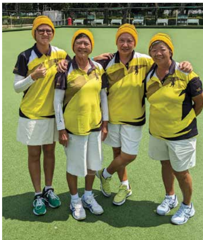
Left: SCC's Ladies Champion Team at the National Fours, Kallang