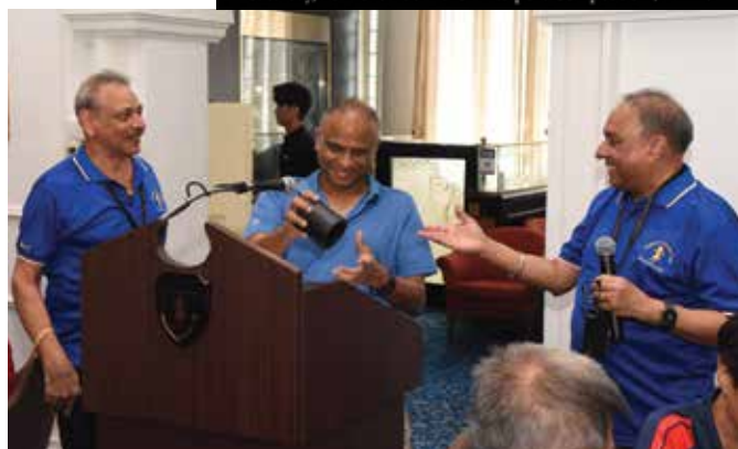
President throwing the box to declare the Interport open.