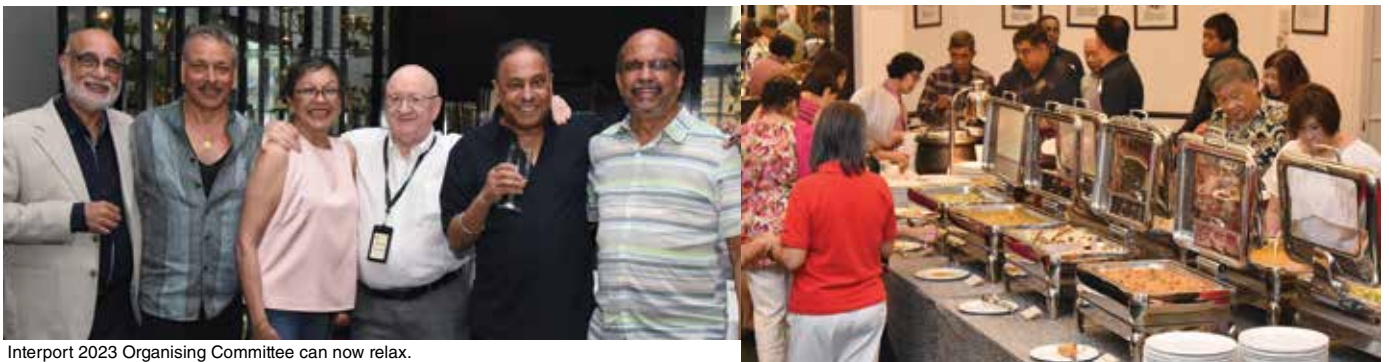
Interport 2023 Organising Committee can now relax.