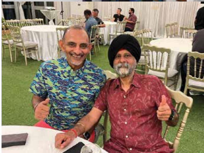
SCC Deepavali Golf Game at the Warren Golf & Country Club