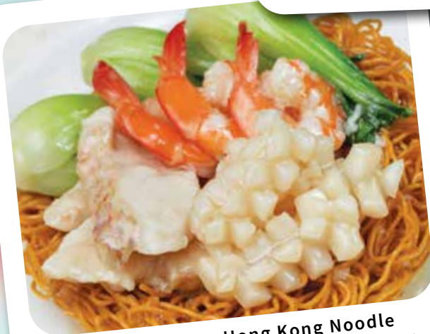
Seafood Crispy Hong Kong Noodle Prawns, Flower Squids, Red Snapper Fillet & Xiao Bai Chye $13.00