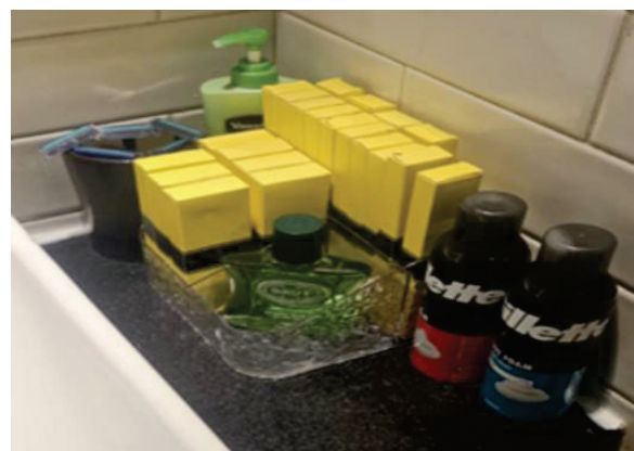
Toiletries in Men & Women Changing Room