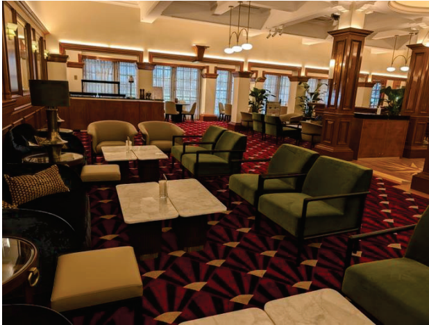
Main lounge refurbished

I consider being in the committee, to be my voluntary RESPONSIBILITY towards the Members and an OPPORTUNITY and PRIVILEGE to contribute to this institution which will far outlive us.