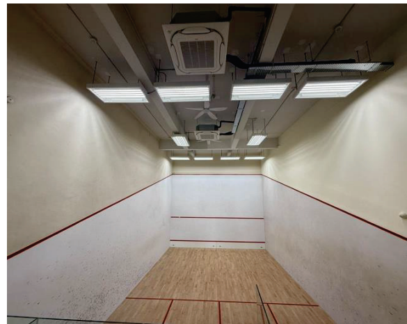
Squash Court Aircon Installed - unique to SCC