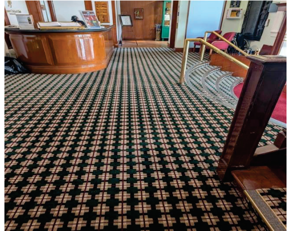
New carpet installed at club lobby & entrance