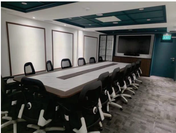
Committee Room refurbished