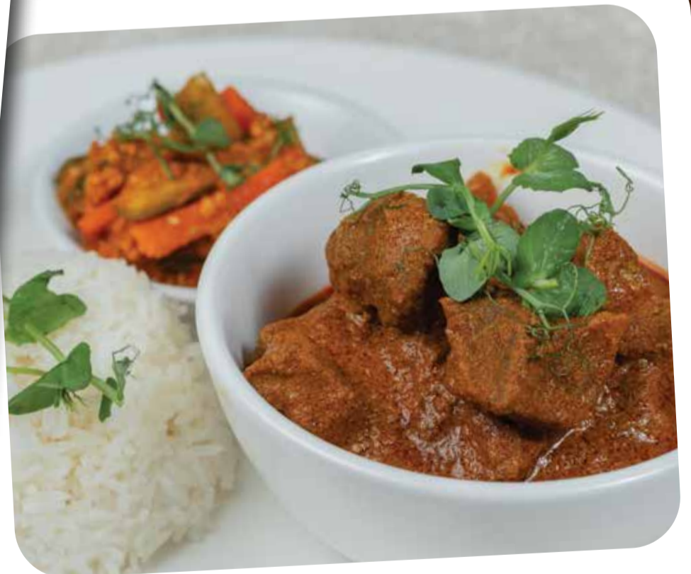
Mutton Rendang Served with Plain Rice & Vegetable Achar $16.50

All photos are for illustration only. Actual products may vary. All promotions are subject to change.