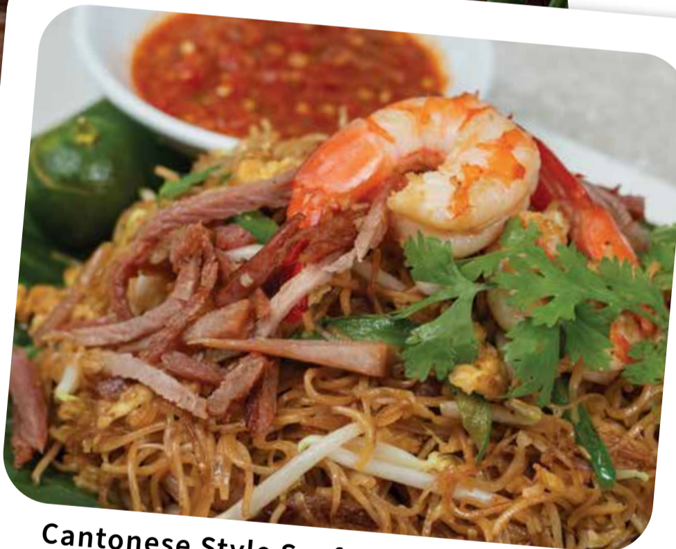
Cantonese Style Seafood Fried Noodles Wok-fried Egg Noodles with Green Peppers, Pork Char Siu & Prawns $14.50