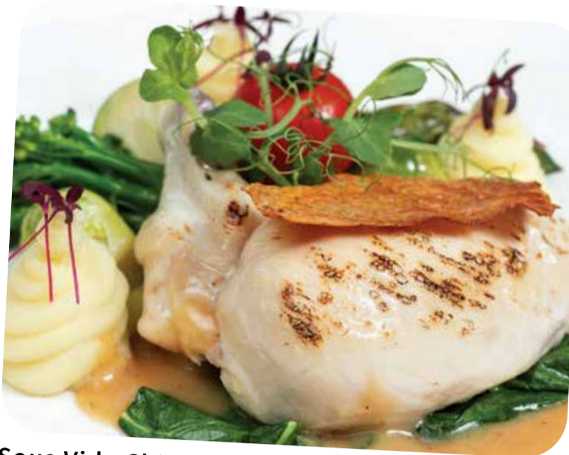
Sous Vide Chicken Breast with Albufera Sauce Served with Polonaise Greens and Idaho Pomme Puree $17.00