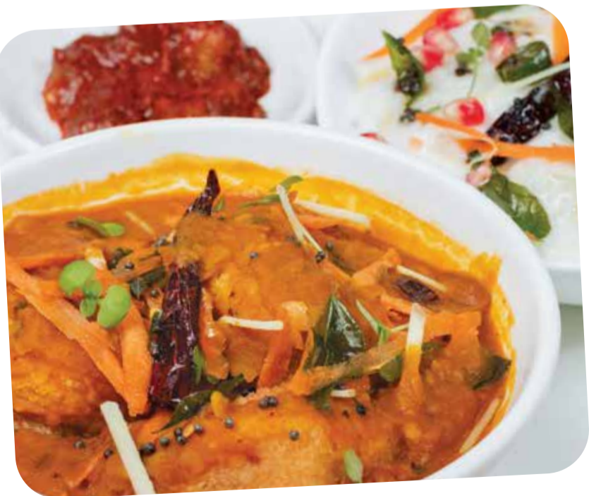
Sambar Vadai Served with Curd Rice and Pickles $14.00