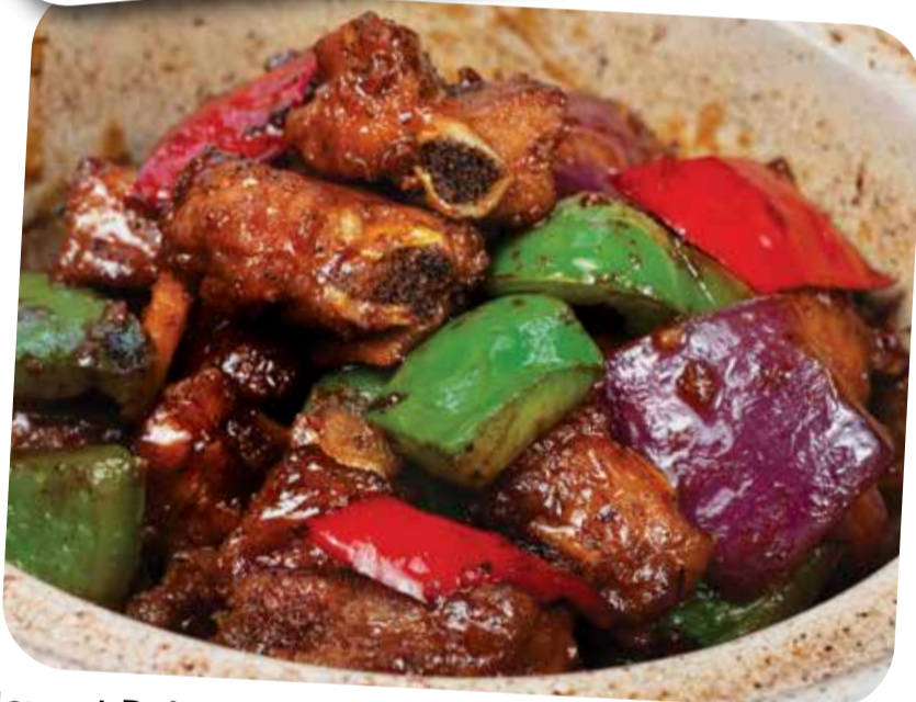
Claypot Baby Back Pork Ribs with Black Bean Sauce Served with Green Capsicum, Red Onions and Sliced Red Chilli $13.50