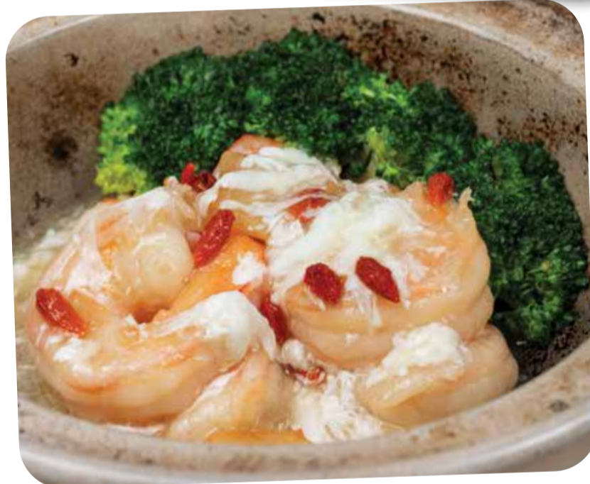
Claypot Blossom Shrimp Balls Served with Broccoli, Wolfberries and Fried Ginger $15.00