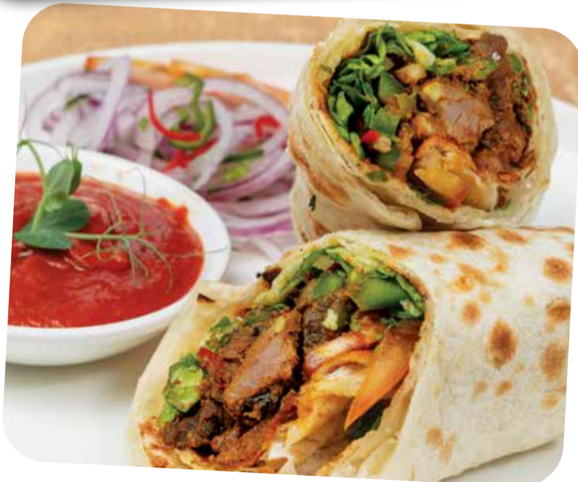
Lamb Naan Wrap Served with Onion Salad and Red Pepper Sauce $12.50