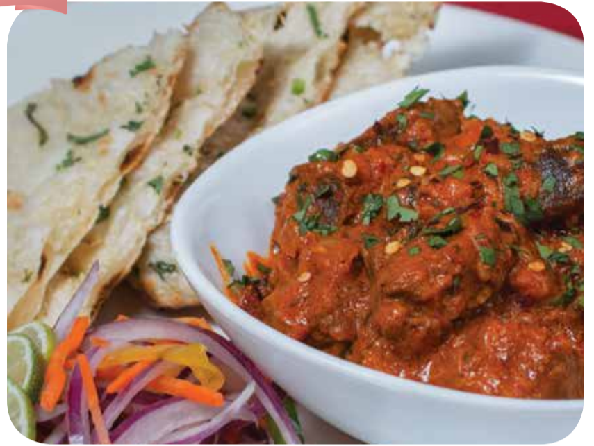
Rajasthani Laal Maas Served with naan (Choice of plain naan, garlic naan or butter naan) $14.20