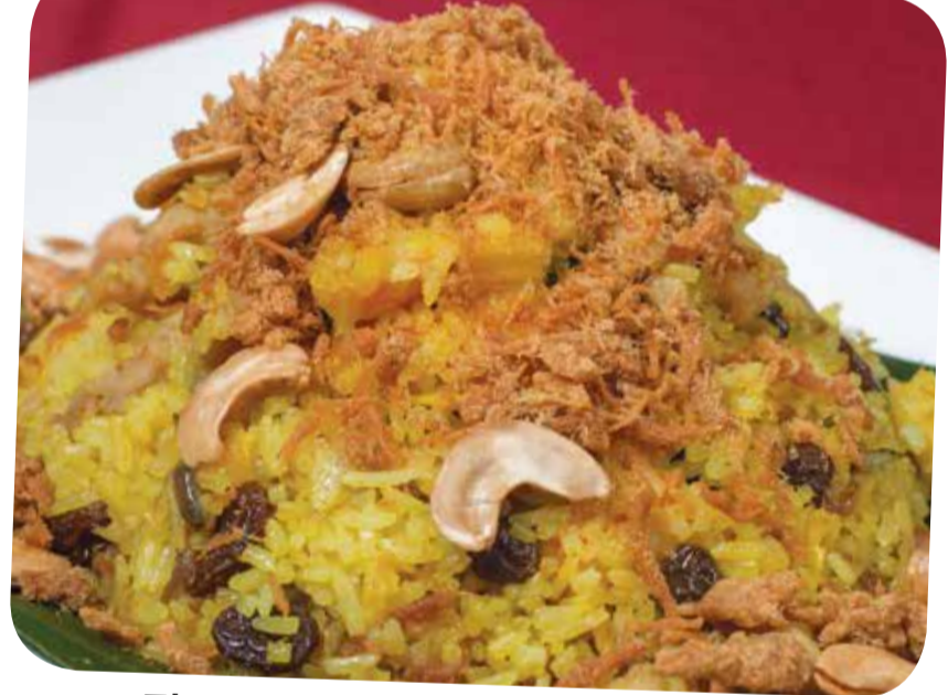
Thai Style Pineapple Fried Rice Stir-fried fragrant rice with prawn, pineapple, raisins, meat floss and cashew nuts $10.60