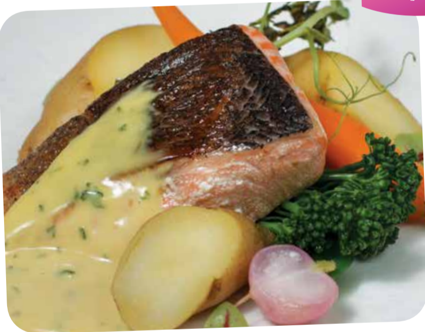
Olive Oil Sous Vide Salmon Loin With Broccolini, fingerling potatoes, artichoke & mustard vinaigrette $24.90